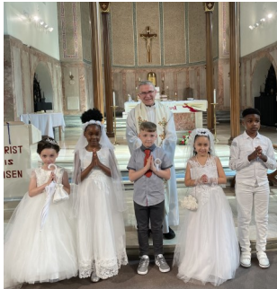
Congratulations to all our pupils who have recently made their First Holy Communion.

School breaks up for half term on Friday 24th May at 3.15pm. School is closed for two weeks. School re opens on Monday 10th June. The gates will open at 8.45am.